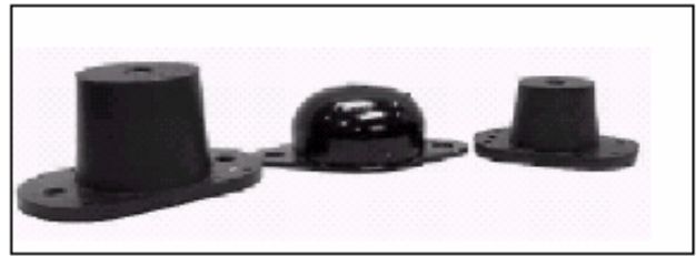
Figure 2: Isolation mounts

Isolation mounts are one-piece moulded neoprene, often with non-skid ribs on the bottom load surfaces. Each isolator incorporates bolt-down holes on the bottom load surface and a tapped steel top load plate for attachment to the supported equipment. Isolators are designed for up to about 4mm deflection and are available in a range of sizes, and load capacities. Mounts can be fixed with masonry anchors to concrete pads under heat pumps.