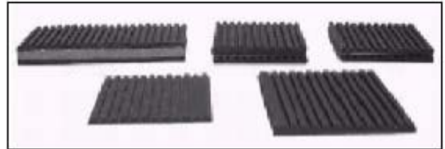
Figure 3: Isolation pads

Isolation Pads are single-ribbed or double-ribbed high quality elastomer, used singularly or in multiple layers, separated with steel shims. Pads are available with rated deflections from 1- 5 mm.