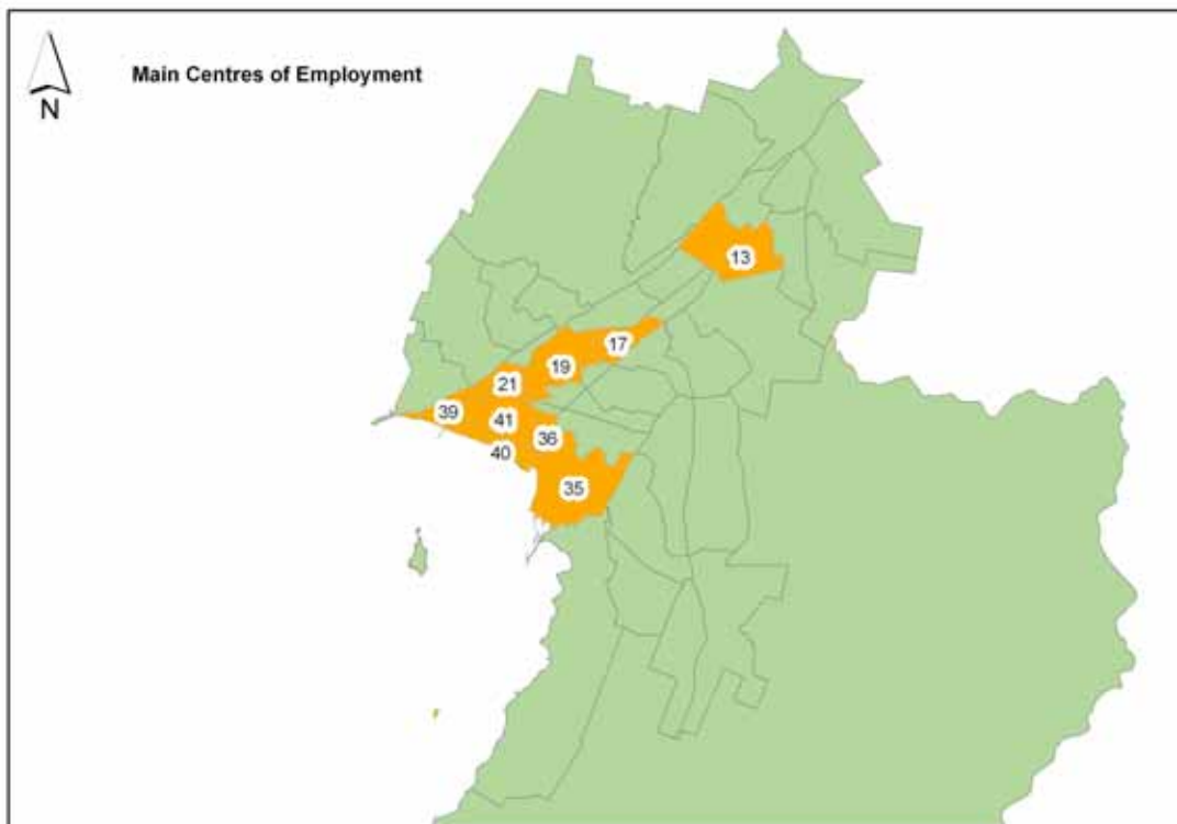
Figure 39: Main Centres of Employment