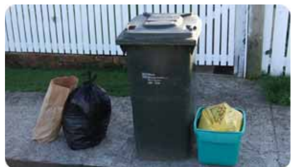
135,000 tonnes of material enters Hutt Valley landfills every year