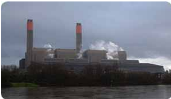
Huntly power station can use up to 3.5 million tonnes of coal every year – 875kg of coal per capita

The concern about environmental sustainability was again raised in consultation on the 2006-2017 long term council community plan, where environmental sustainability issues were the top rated issues, along with flood protection and safety.