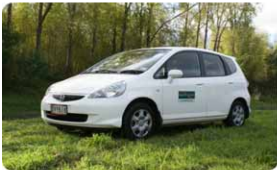
Hutt City Council operates a fleet of Honda Jazz's - which use only 55% of the fuel an average vehicle does