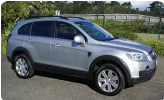
NZ vehicles are becoming less fuel efficient per km travelled

This theme of continual progress has been carried through into the strategy's vision.